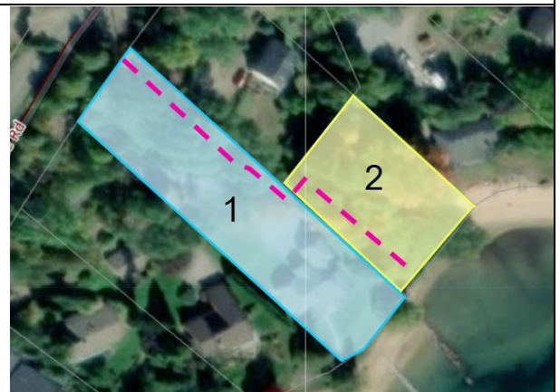
Figure 1: Pink is approximate new lot line.

The boundary between two properties is proposed to be shifted to create a panhandle for parcel 2, which currently does not have access to Johnstone Road. The panhandle is required for Nelson Hydro to service the property.