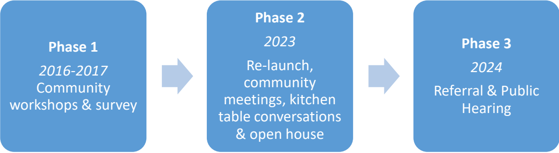
Figure 1: Engagement Process