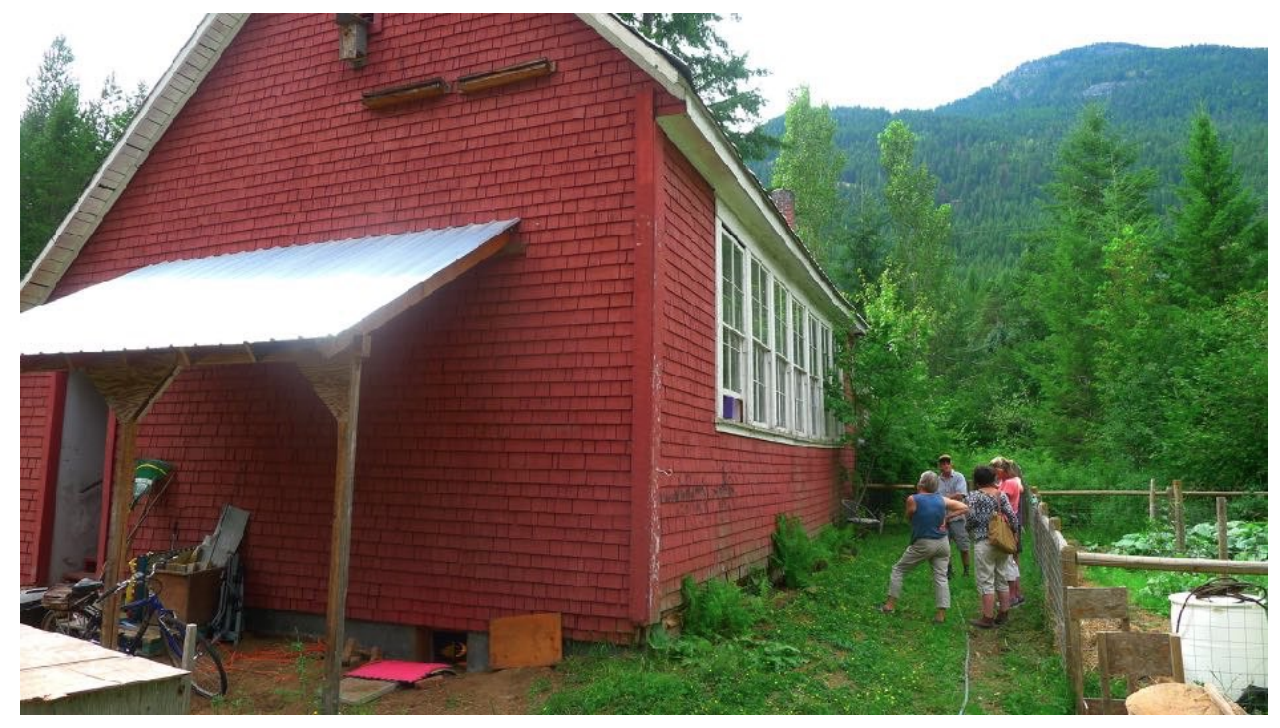
Rear and north side of the building