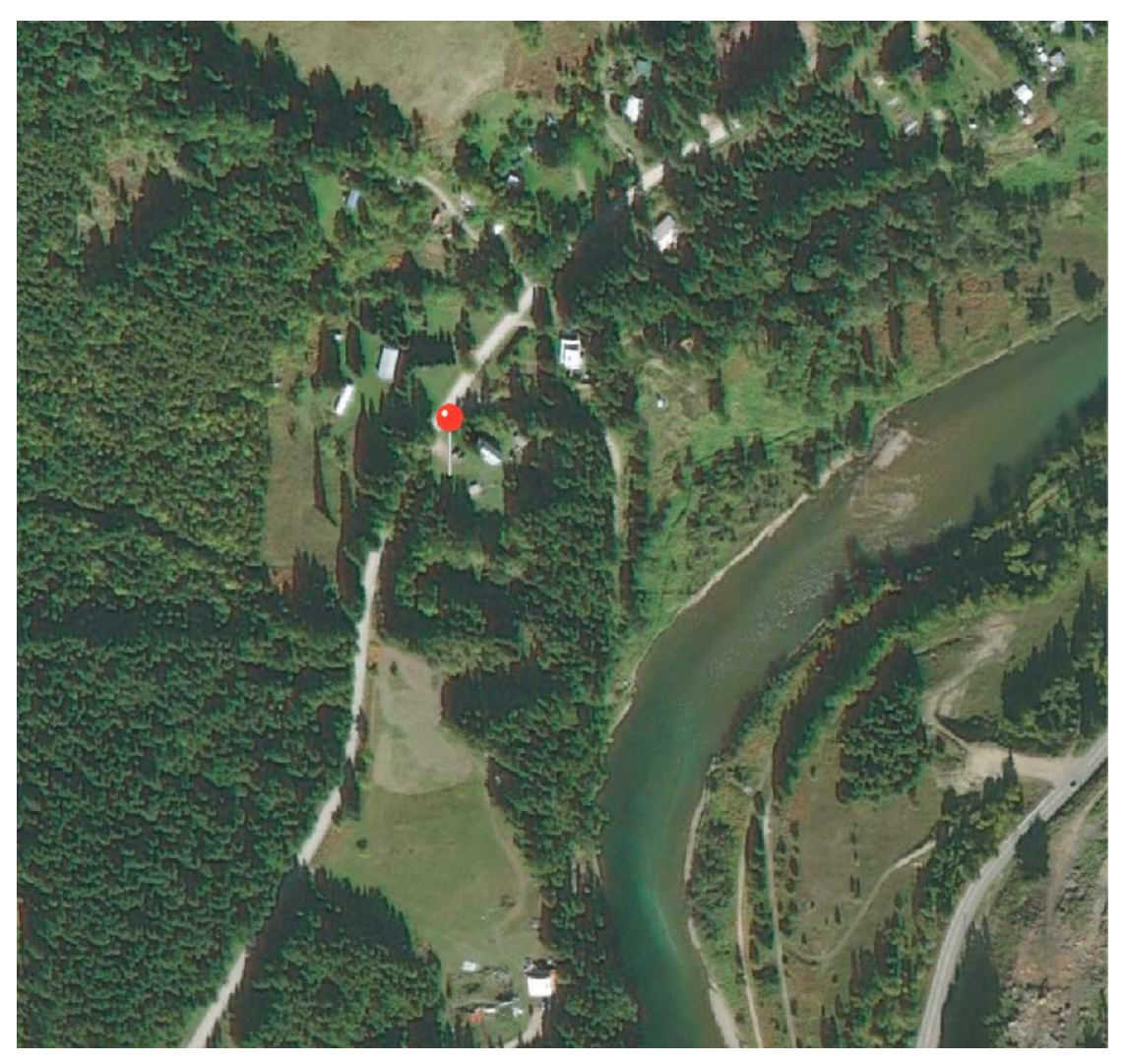
Vallican Heritage Hall located on a 2016 aerial view