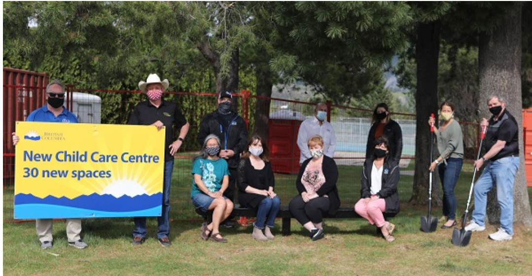
Media photo – construction mobilization