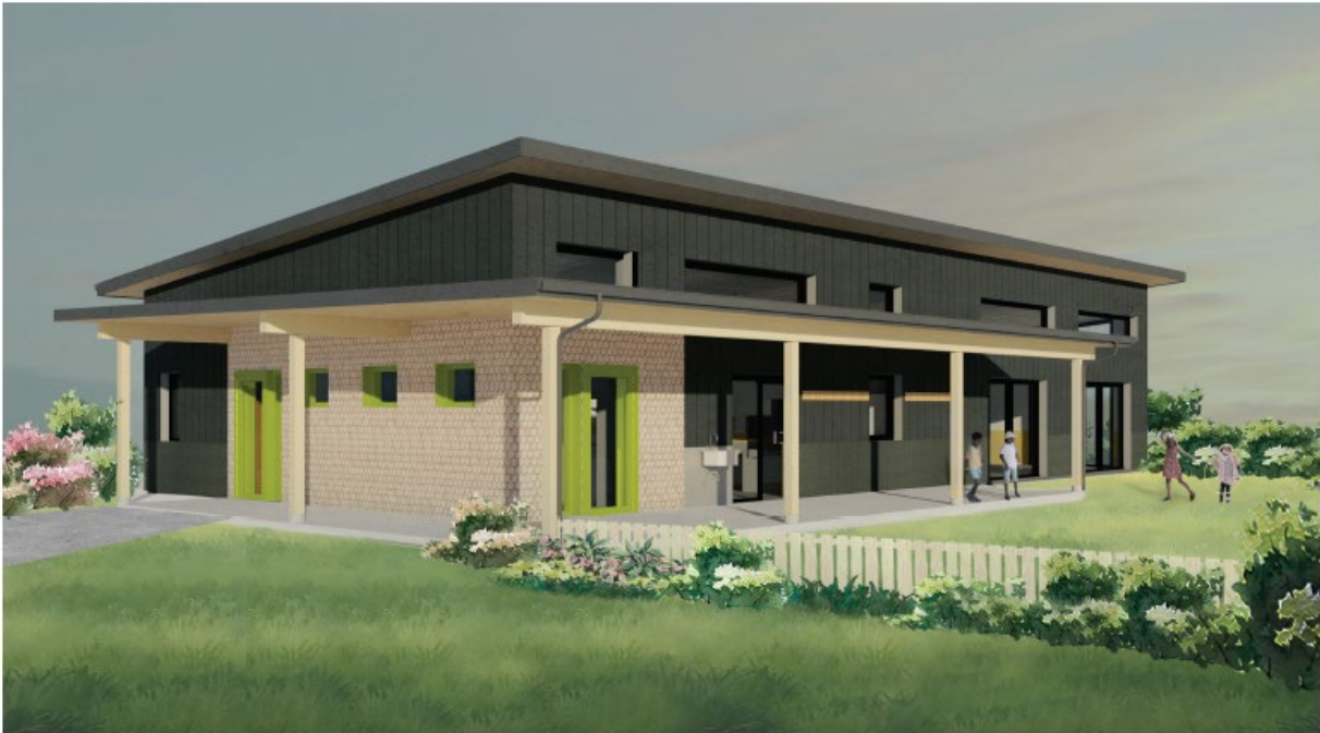
Castlegar & District Child Care Centre rendering