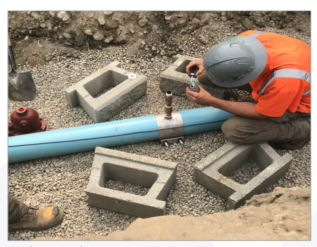
Balfour Wharf Road water main replacement