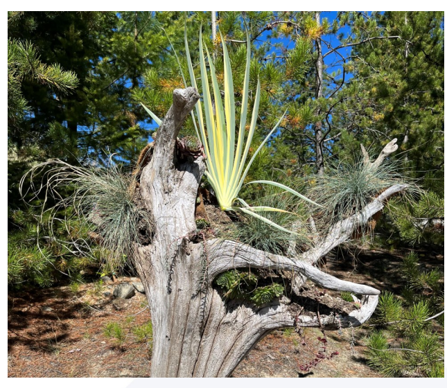
Your water conservation efforts, such as xeriscaping, help prevent water shortages!