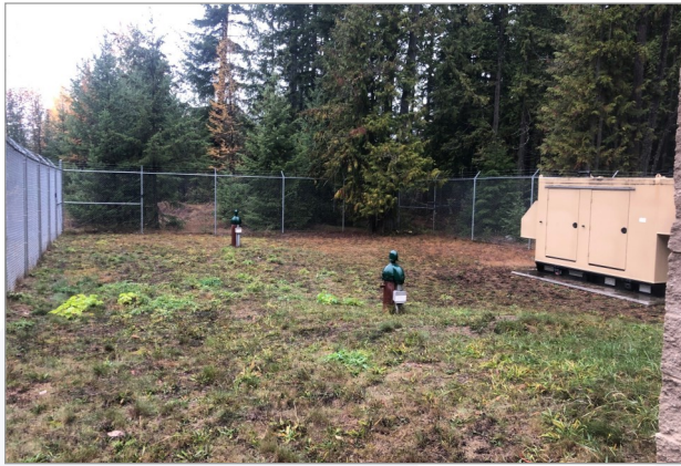
Burton wells, 2022